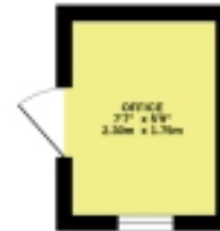
1ST FLOOR 171 sq.ft. (15.9 sq.m.) approx.